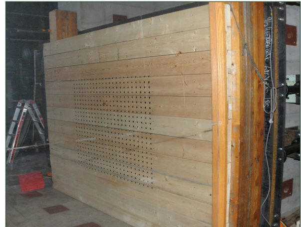
Lumber safe room wall prior to impact testing.

Impact tests are conducted on 8-foot-wide by 7-foot-high wall panel. The initial design incorporates 2- by